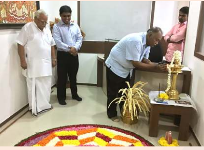
Onam 2017 at Trivandrum