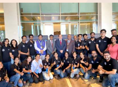
Regional Conference 2019