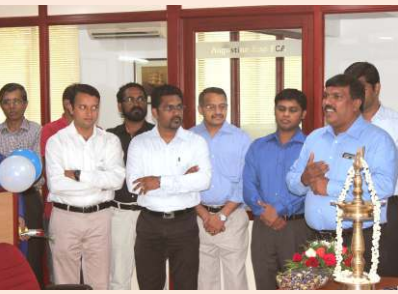
2016-Pallimukku office Inauguration