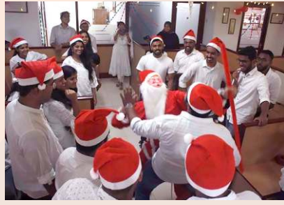
Christmas 2018 at Kochi