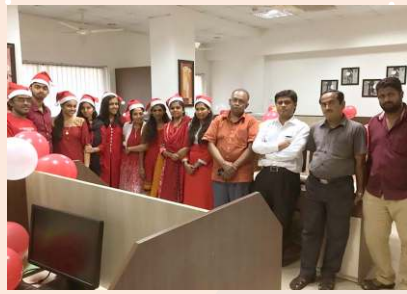
Christmas 2016 at Trivandrum