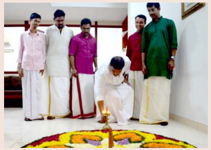
Onam 2017 at Kochi